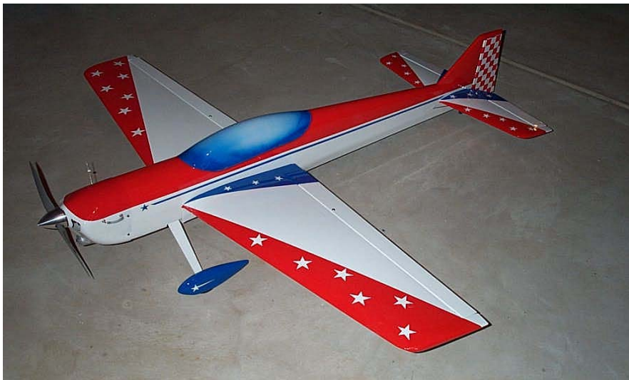
Author's Widebody .60-.90 by CA Model